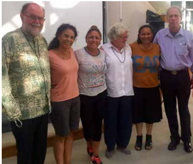
Southern California Facilitators