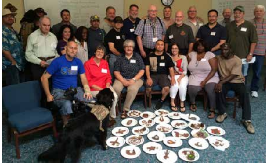
Healing of Memories for Veterans Workshop, Arizona