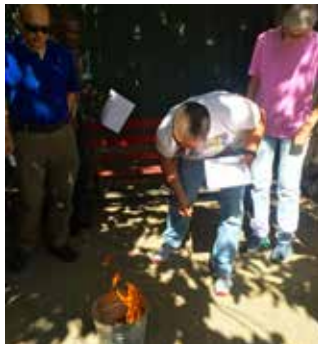
June Veteran Workshop, Wellness Works, Pasadena CA