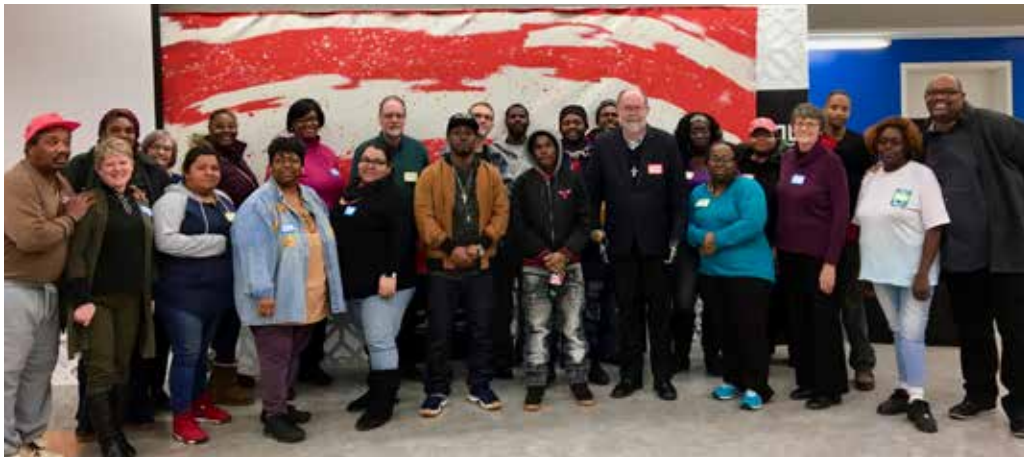
Workshop, Project Hood, South-side, Chicago, IL

“ WE EXPANDED WHERE WE OFFER HOM WORKSHOPS FOR VETERANS, WITH A UNIQUE OPPORTUNITY TO FACILITATE A WORKSHOP AT THE RIKERS PRISON VETERANS ONLY UNIT IN NYC.