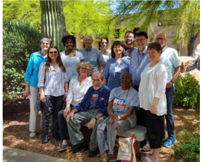
IHOM-NA Programme and Development Committee, Spirit in the Desert, Carefree, AZ