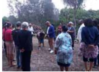
Women's workshop - KZN