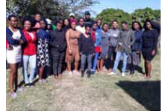
Zoey-Life - KZN

Some feedback of participants on the impact of Healing of Memories workshops: