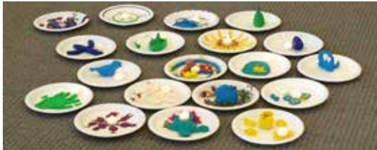
AZ peace symbols

Discussion centered on the need for more lead and small group facilitators and ongoing training for both authorized facilitators and trainees. There was also discussion of programming related to site/constituent, such as the veterans' workshops held in Phoenix at Spirit in the Desert and the Franciscan Renewal Center. Suggested funding coordination included communicating about scheduled programmes and needed funding for these, communicating programming priorities, and progress toward programme development, and grant writing coordination.